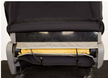
Attach both ends of velcro from the seat back together.