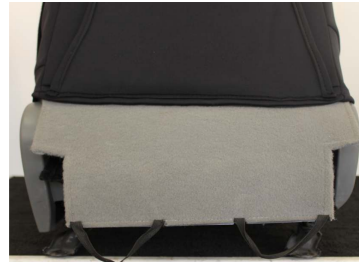
Detach change catcher