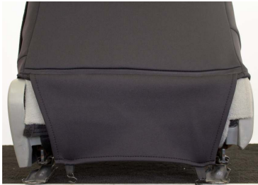
Pull seat cover over and into the seat back