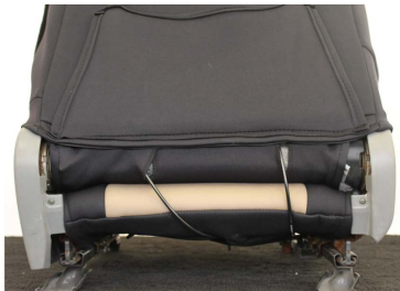
Follow up to step 9