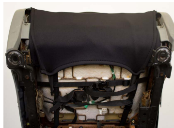
Pull flap down and under the seat and attach hooks to secure the flap to the seat bottom.