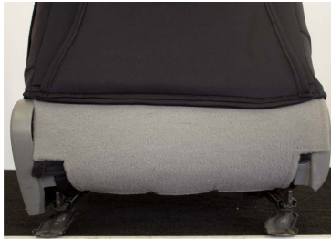
Pull flap up temporarily