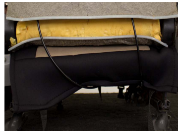
Rear view of seat bottom cover installation