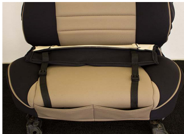
Install seat bottom cover starting from the front of the seat to the back