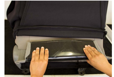
Bend and insert the change catcher under and into the seat back between the stock material and the neoprene seat cover