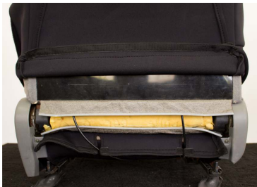
Follow up to step 4